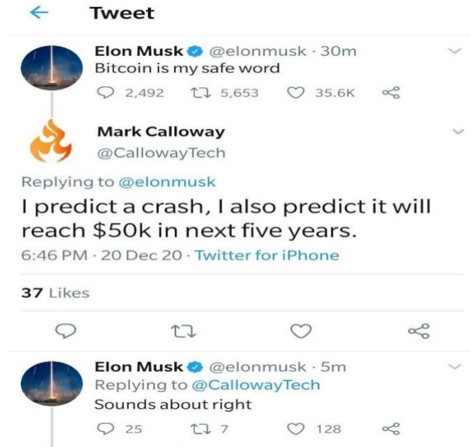
Elon Musk's Tweets about Bitcoin (6)

Finally, it can be said that Elon Musk is in the middle of both of the arguments. The successes of him and his companies cannot be refuted. However, his persona has great room for doubt. He is a shrewd businessman more than he is humble, and maybe he earns more credit than he should be given. But in the end, he is no saint nor devil, and whether he is a genius pioneer or a capitalist thief, Tesla and SpaceX's innovations ultimately help the human civilization in the long run.