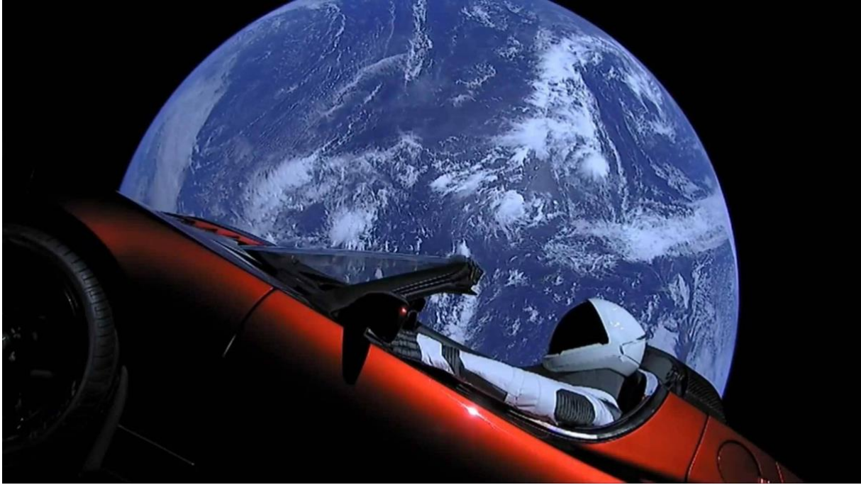
Tesla Roadster in Space (4)